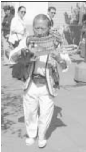
This native Educadoran musician enchants passersby in a plaza in Quito, Ecuador.

“Our project to bring a team of volunteers to rural Ecuador is progressing very well. Our staff member in Ecuador has been meeting with community leaders in the two towns we will visit, and they have developed a first draft of a very exciting itinerary. Our volunteers will be meeting with