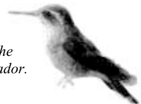
Female hummingbird from the cloudforest west of Quito, Ecuador.

Please send your prayers and blessing to all parties involved—and remember that you, too, are welcome to take a more active part in this mini-grant process, through your money, time, energy, and mentoring support. 🌍