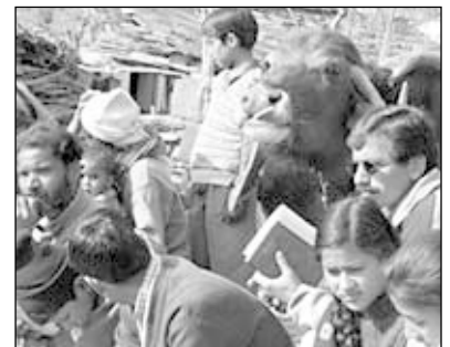
Children at the workshop came from the districts of Uttarkashi, Tehri, Chamoli, Pithoragarh, Bageshwar and Almora.

“We will discuss the importance of identifying the types of natural disasters that may occur in a community and how the people can best prepare for it. The children will also be asked to return home and speak to their village council about forming a disaster management plan, and the MCF chapter can take on the role of being the coordination team. Over time